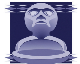
Sto:lo Research & Resource Management Centre

The Stó:lō Research and Resource Management Centre is a department of the Stó:lō Service Agency. This group of experts has many years of experience working within the Stó:lō community. They provide professional service with an understanding of, and respect for, Stó:lō protocols. They maintain strong research ties to local universities and consulting firms and offer high-quality services that are both culturally and scientifically sound.