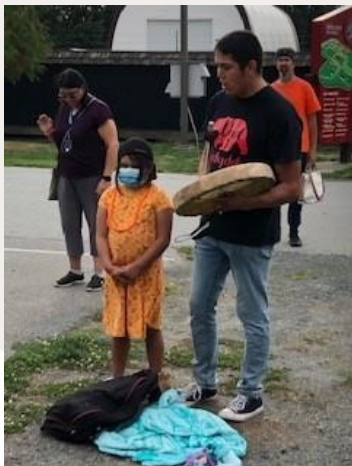
Drumming at the Suicide Prevention Day Event