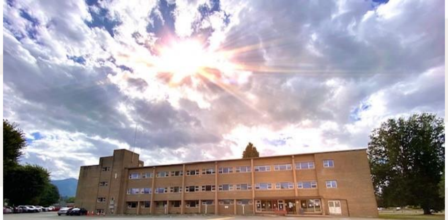
Building 1 is set to come down in early October 2021.