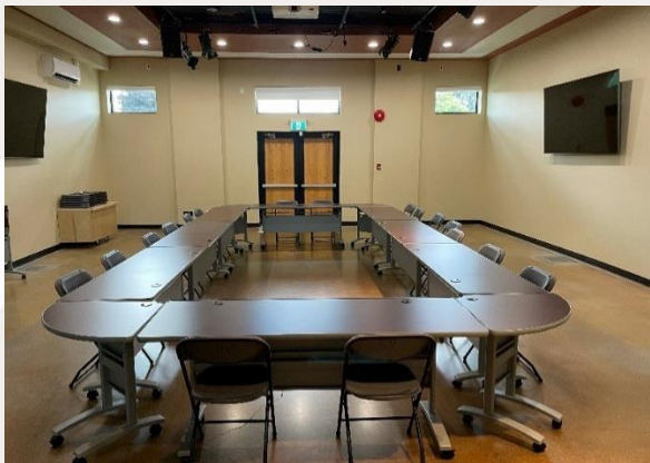
Newly completed Meeting room in Building 10.