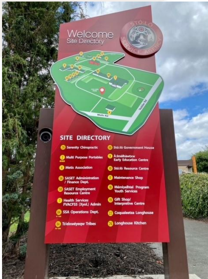
Updated Site Signage at Coqualeetza!