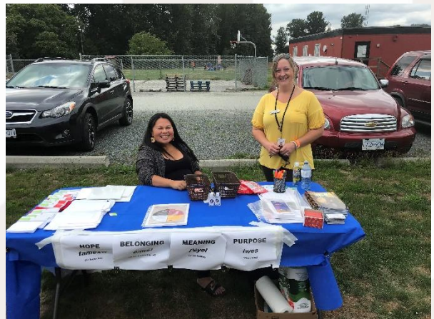
Volunteering at Suicide Prevention Day Event