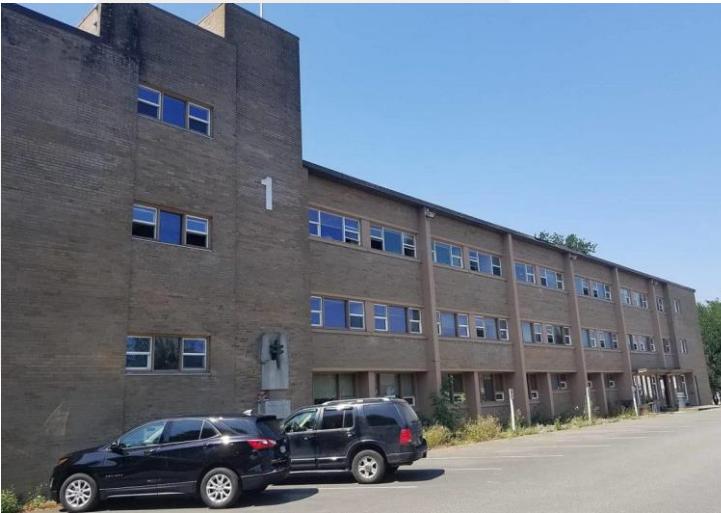
Building 1 set to be demolished in early Fall 2021